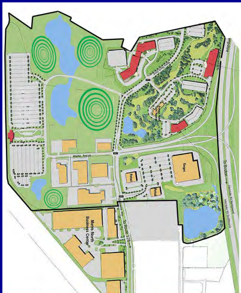
Industri-plex Superfund Site Woburn, Massachusetts