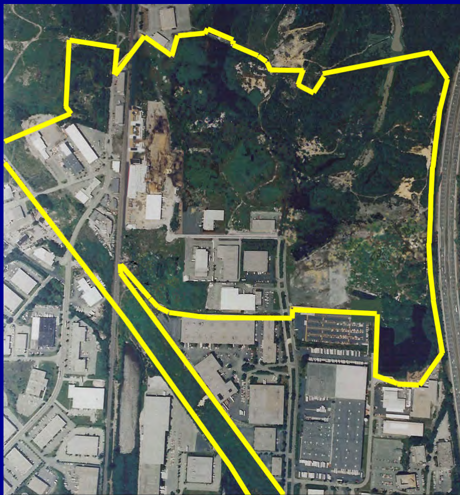
Industri-plex Federal Superfund Site Woburn, Massachusetts